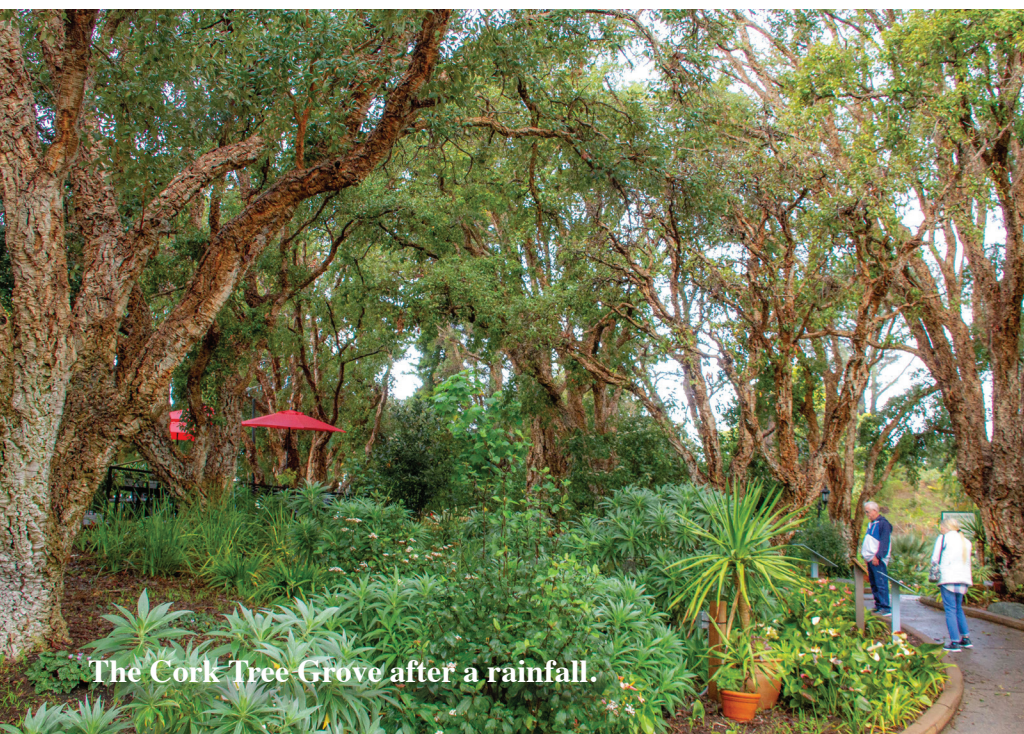
The Cork Tree Grove after a rainfall.

This year has gotten off to an exhilarating start and promises to get more and more exciting as we move through the seasons. I look forward to seeing you all in the Garden.