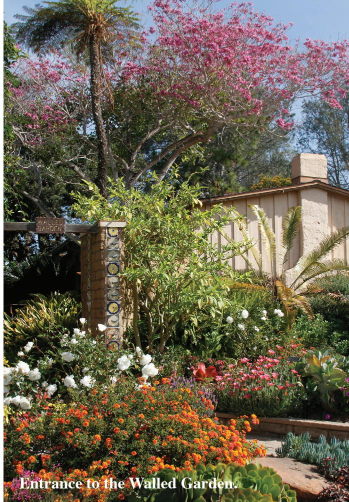
Entrance to the Walled Garden.