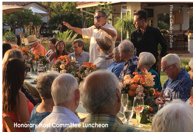
Honorary Host Committee Luncheon