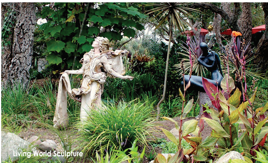
Living World Sculpture