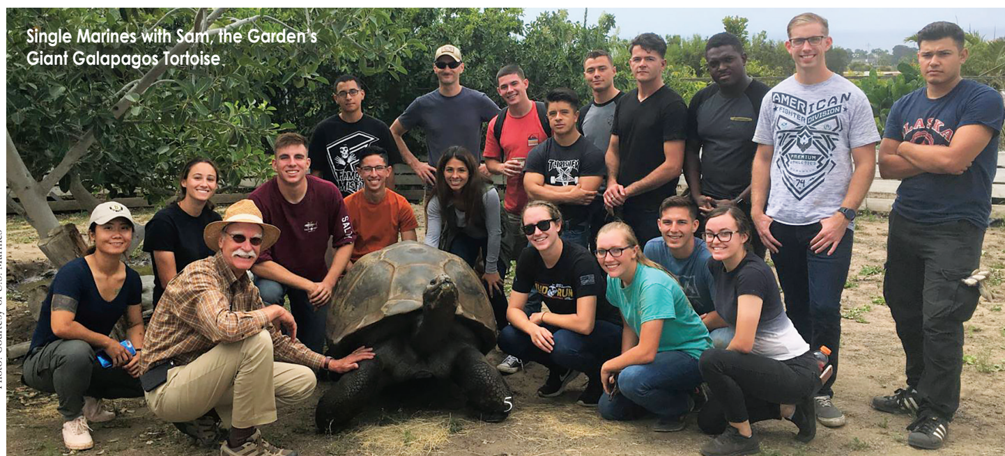
Single Marines with Sam, the Garden's Giant Galapagos Tortoise

The Garden is thankful to the U.S. Marines for assisting us in relocating these plants to their new home!