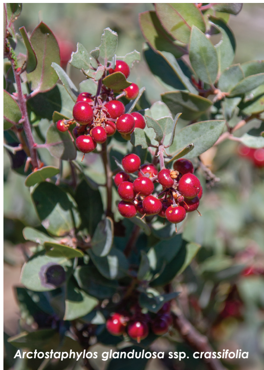
Arctostaphylos glandulosa ssp. crassifolia