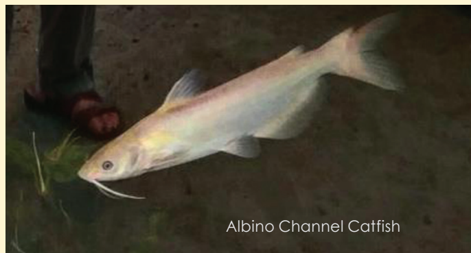
Albino Channel Catfish