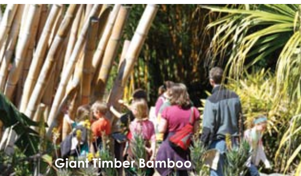
Giant Timber Bamboo

The SDBG has almost 200 individual plants in our bamboo collection including over 120 taxa. Our tranquil 2.2 acre Bamboo Garden showcases the largest public collection of bamboo in the nation! The following are several of our favorites: