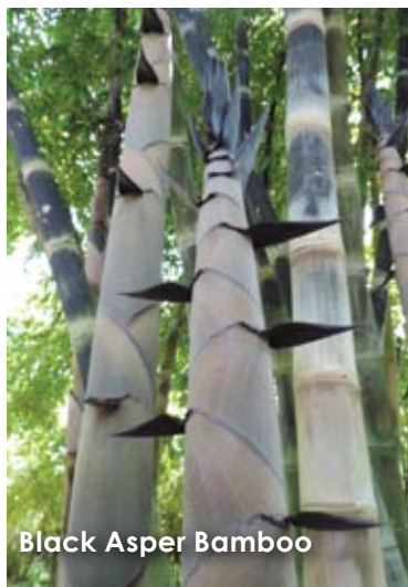
Black Asper Bamboo