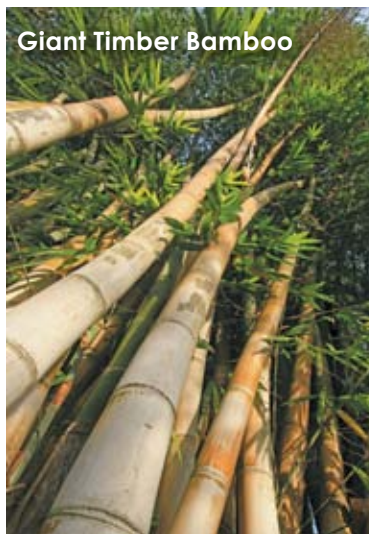
Giant Timber Bamboo