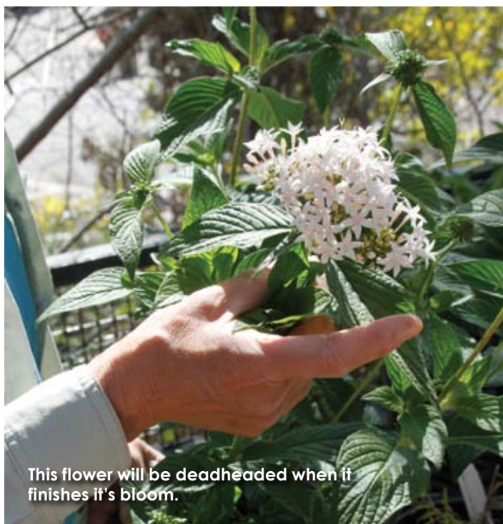
This flower will be deadheaded when it finishes it's bloom.