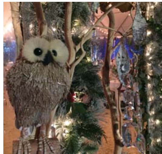
Winter Night in the Garden décor created by the San Dieguito Garden Club