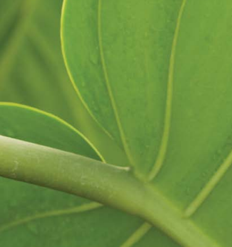
CONSERVATORY CHALLENGE MET!