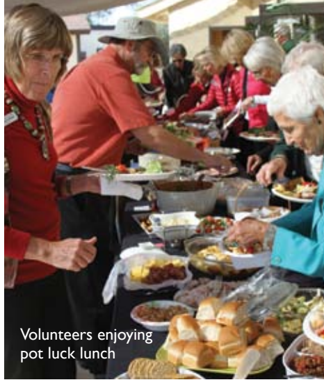
Volunteers enjoying pot luck lunch