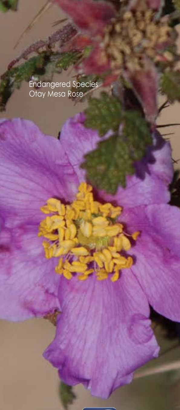
Endangered Species Otay Mesa Rose

Cost: Free with admission or membership.