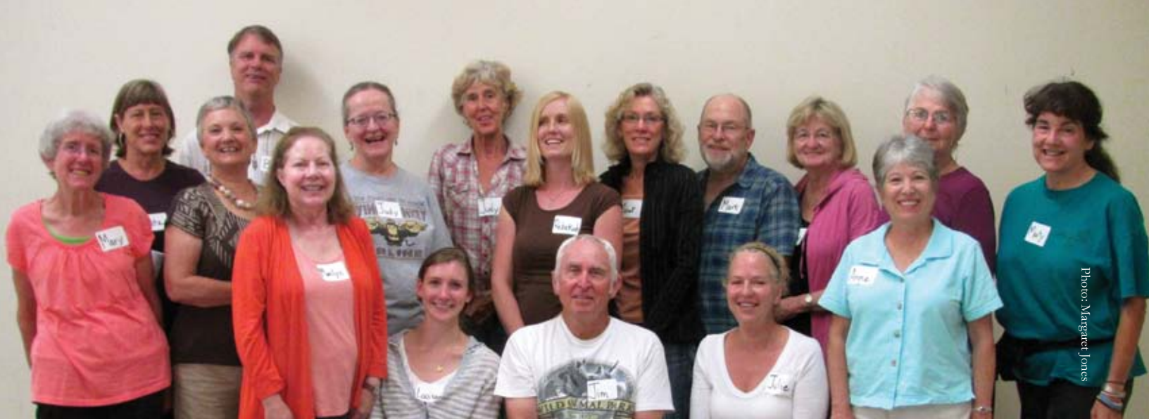
Our newest volunteers pose for a group photo after their Volunteer Orientation.