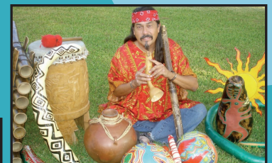
Music from Ancient Homelands