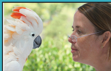
Avian Eyes Interactive Outreach