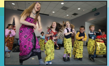
Dance Around the World