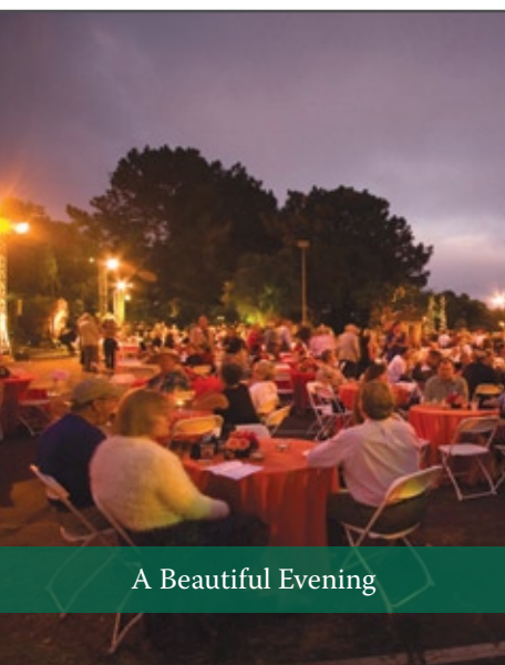
A Beautiful Evening