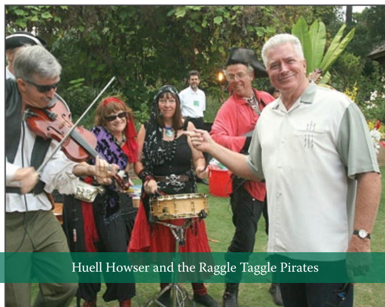
Huell Howser and the Raggle Taggle Pirates