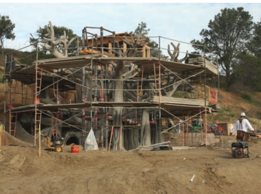
Hamilton Children's Garden under construction