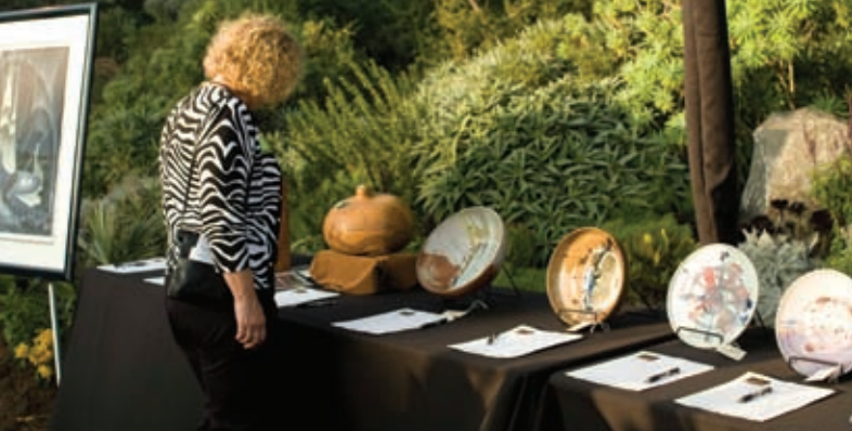
Silent Auction Display