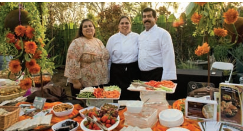
Authentic Flavors Catering; Organic Elements Floral