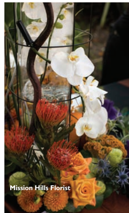
Mission Hills Florist