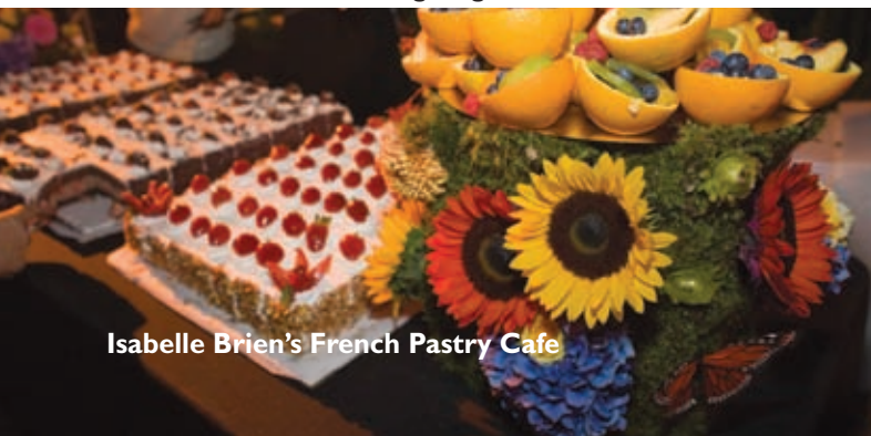
Isabelle Brien's French Pastry Cafe