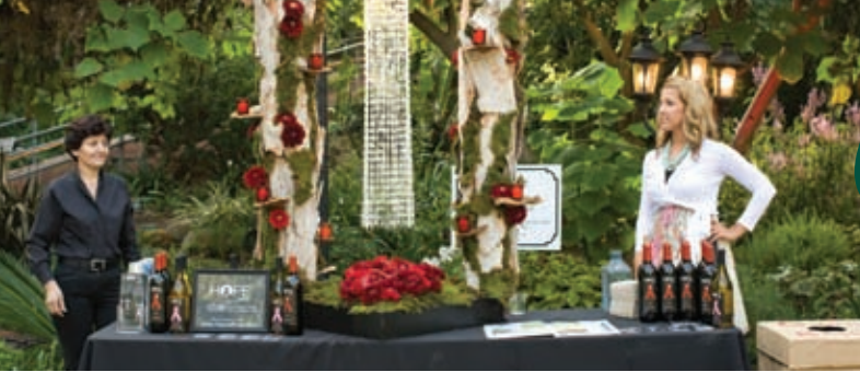
Hope Wine; White Wedding Day Events Floral

For additional Gala information, please contact Cheryl Mergenthaler at 760/ 436-3036 x218 or cmergenthaler@qbgardens.org .